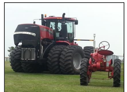
500 hp vs. 14 hp