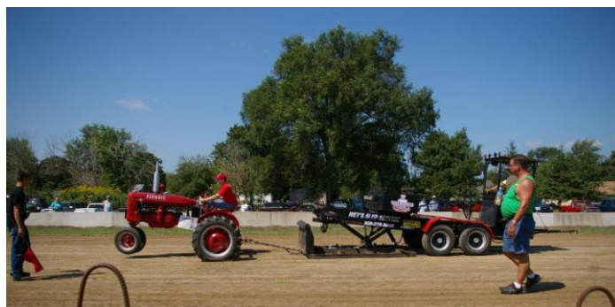
Too much red power?

The DVD of the 2010 Farm Heritage Days show will be available at the banquet. Cost is $6.