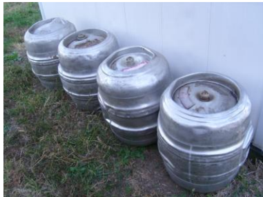
Top secret location!!

Thanks Terry B. for locating 4 old beer kegs for the tractor games for next year. We will have narrow front racing at the next year's show, maybe IH vs. JD ?? Or Dan vs. everyone else??