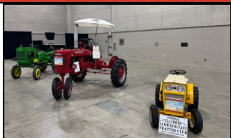
Peoria Farm Show Display