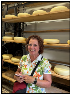
Dutch Cheese Farm

Illinois 91 is closed at the railroad viaduct near the Illinois 90 junction, east of Princeville. The closure is necessary for drainage and pavement improvements around the viaduct and is expected to last into mid-September. A detour should be posted, so allow a little extra travel time coming and going from the meeting.