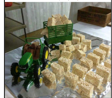
RICE KRISPIE TREAT HAY BALES - Such a fun idea for a farm themed party!! ❤️

A: While the project was code name Farmall X, or Original, it had other names associated with the project: Ranch All, Cub-Ette, and Cub Urban.