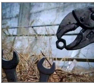
RARE PHOTO OF MOTHER WRENCH FEEDING HER YOUNG